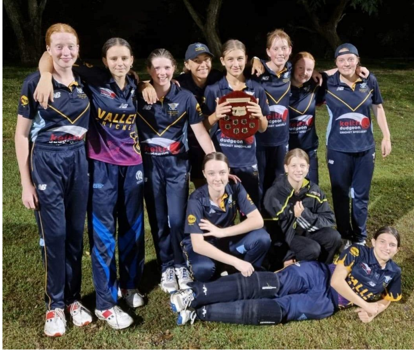
Harris Shield premierships winners.