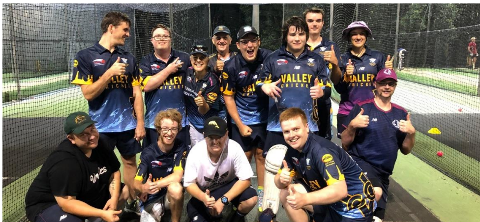
All Abilities Program participants and coaches in the nets at Ashgrove.