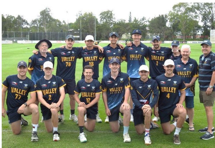
Men's First Grade prior to play against Wynnum-Manly at Bill Albury Oval.